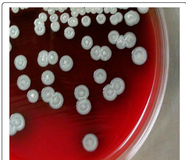
Fig. 2 Burkholderia pseudomallei colonies on blood agar: they are creamy white with concentric ring-like pattern

resistant to ceftazidime and most other antibiotics. It was only susceptible to imipenem and TMP-SMZ. Our patient recovered following treatment with intravenous imipenem and oral TMP-SMZ for 4 weeks, and 3 months of oral TMP-SMZ, as per the recommendations. He was doing well on follow-up. Intravenous imipenem and oral TMP-SMZ may prove efficacious for the treatment of suppurative parotitis caused by B. pseudomallei .