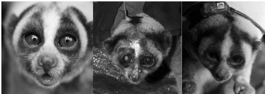
Figure 5 Male wild Nycticebus javanicus , from Cipaganti near Garut, Java, during three successive captures in April 2012, November 2012 and February 2013, showing his appearance before receiving a severe conspecific bite wound, just afterwards, and 3 months afterwards.

Still's [58] was the first anecdotal account of the uncanny resemblance of the slender loris ( Loris sp.) to a