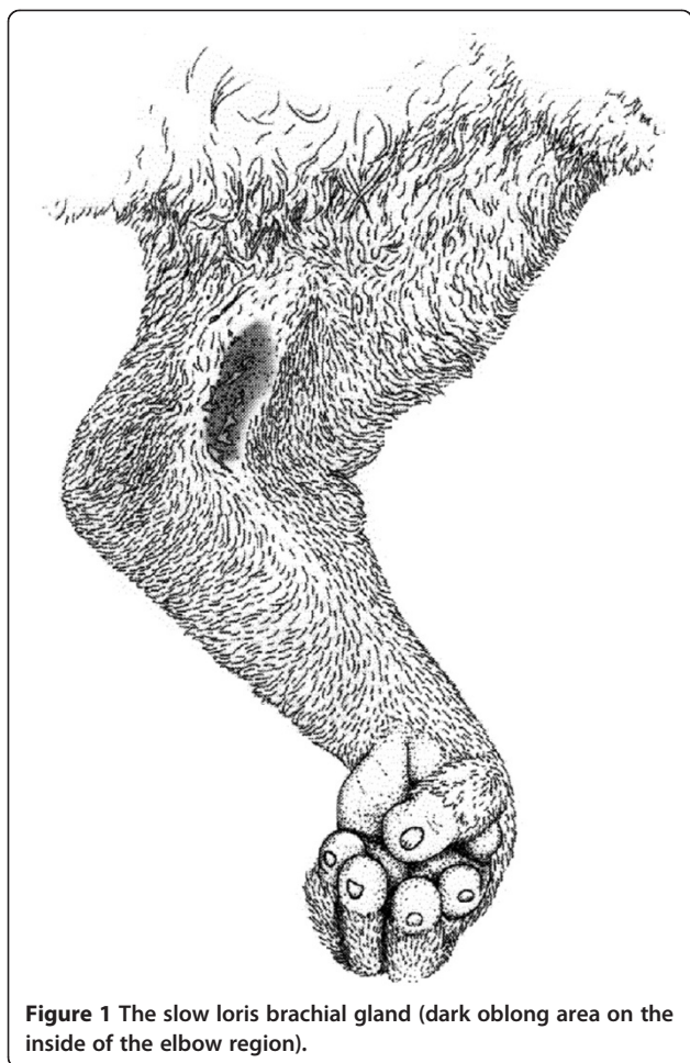
Figure 1 The slow loris brachial gland (dark oblong area on the inside of the elbow region).

Local beliefs only give us a starting point to search for the nature and function of slow loris venom. Alterman [8] was the first researcher to show with in vivo experiments that loris venom can actually kill other animals. In a set of experiments where he injected secretions from captive greater slow lorises ( N. coucang ) into mice, Alterman discovered that loris venom was only deadly when secretions from a loris' brachial gland (brachial gland exudates – BGE) were combined with saliva. Death rates of mice differed based on the extract used to dissolve the toxin. From this Alterman concluded that lorises may possess two toxin types: one fast-acting aqueous toxin and a second toxin that enters the