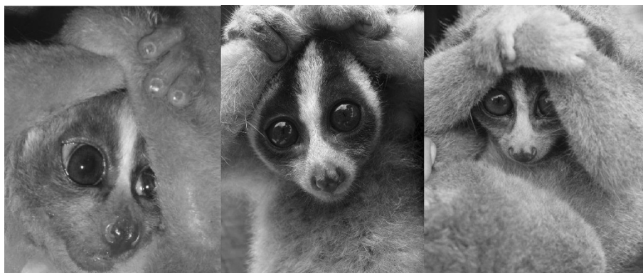
Figure 2 Slow lorises in defensive posture, whereby the arms are raised above the head to combine saliva with brachial gland exudate: N. menagensis , N. javanicus and N. coucang .

circulatory system more slowly, although he was not able to characterise this biochemically.